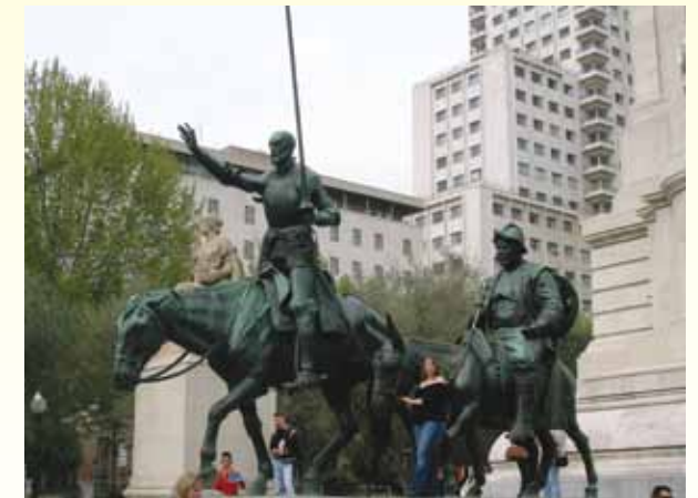
ABOVE: Statue of Don Quijote in Madrid, Spain

God continues to surprise us with new ministry opportunities.