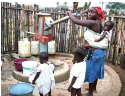
ABOVE: New well in village