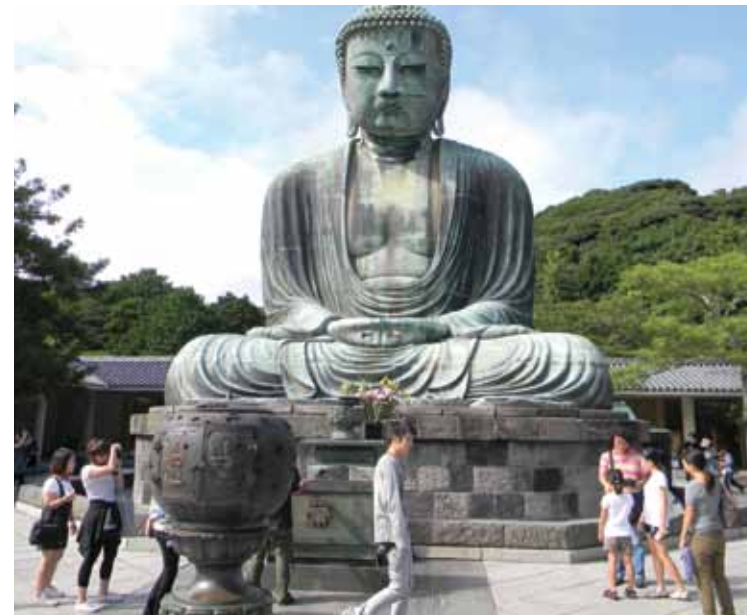
LEFT: Great Buddha at Nara, Japan