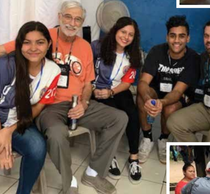
A home visit by members of a team while serving in El Salvador, January 2020.

Two of our Church members and their interpreters in El Salvador.