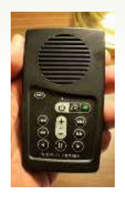
Megavoice broadcast units with microSD card capability

As a follow-up to our visit, we investigated the possibility of creating and circulating audio recordings of leadership training modules and other messages to the ECCOL pastors and church leaders. Our search identified solar-