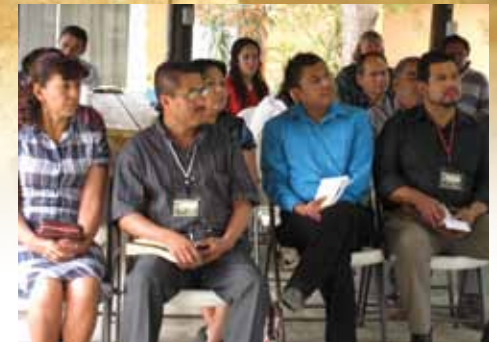
TOP: Mexico's Pastors and lay leaders enjoy training during Annual Conference