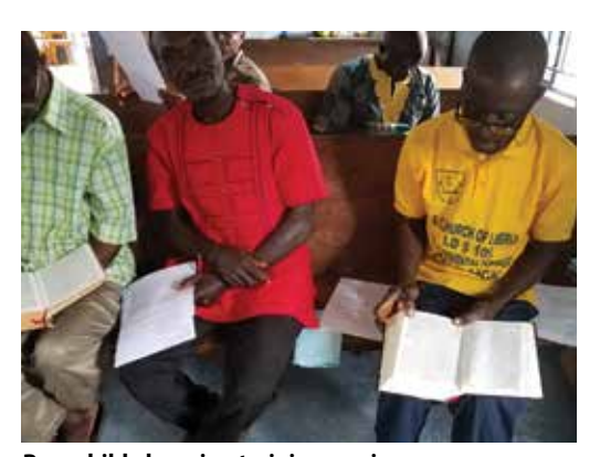
Bassa bible learning training session