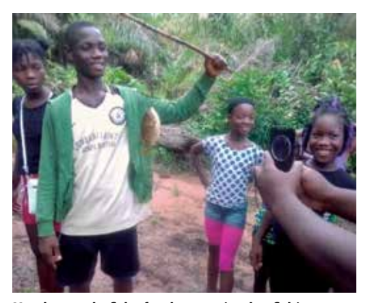
Youths caught fish after been trained to fishing

A total of 56 youths attended the annual youth camp. Twenty gave their lives to Christ. Teaching was focused on renewing your mind (Romans 12:1-2) with emphasis on the teaching of Christ.