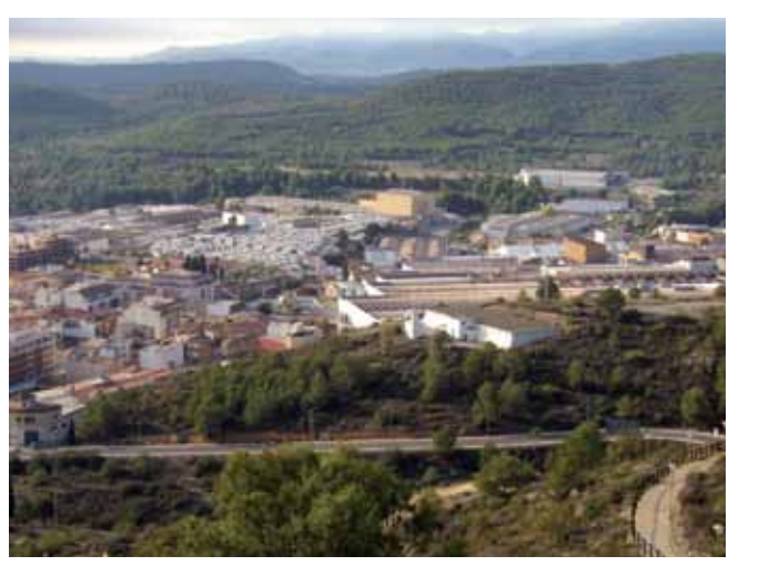
City of Alcora, where Whitakers minister

basically post-Christian. That means Christianity has little to no influence on the society. Many people feel they are Christian simply because they were baptized in the Catholic church, even though they don't attend church or follow its teachings. This is making ministry especially difficult for evangelical church planters in the country.