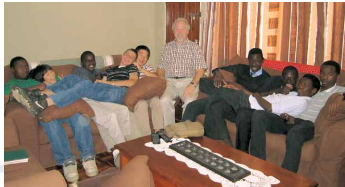
BELOW: At home in the dorm in 2011