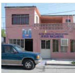
ABOVE: EC Church of Mexico continues to grow