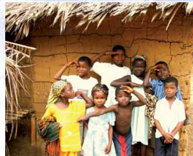
ABOVE: Children in Liberia look for a brighter future

In 2010, ECREP implemented a Livelihood project in (2) districts in River-Cess County under the sponsorship of UNDP. Thirty acres of farm land was cleared and planted with cassava cutting. The objectives of this project were to empower the single farming mothers to enable them pay their children school fees and to make sure that there is enough food in their homes. The cassava was harvested and sold and the proceeds were used to empower the women to establish their businesses through which they have been receiving funds to take care of their children. Importantly, for a hungry child, going to school is not important; having enough food to eat is. Therefore ECREP had endeavored to empower the parents through growing more food to ensure that the children are well fed so that they will concentrate while in school.