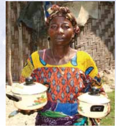
ABOVE: Food for widows

Over the years, ECREP has been providing humanitarian services through donor organizations for the children and youths of Liberia. These activities though very helpful but it is just like a drop of a finger of water in a 55 gallon drum. The needs in Liberia for the provision of safe drinking water, latrines facilities, and food cannot be over emphasized. The availability of safe drinking water in Liberia is put at 45% of the population while latrine facilities are less than 15%. Majority of family households live on 1 meal per day and it is provided late in the evening. All of these put the children at risk and many died between the ages of 1 – 5 years.