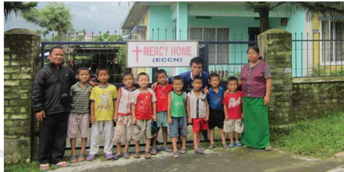
BELOW: Mercy Home relocates

If you would like to partner with the EC Church of Nepal in sharing Jesus Christ among this Hindu nation, make your contribution to GMC, clearly marked "EC Nepal" and send it to the GMC office.