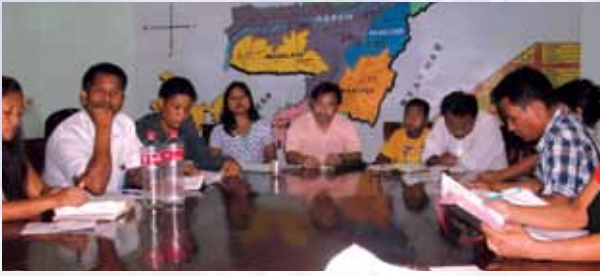
ABOVE: ECCI missionaries in training

"Let us thank God for all He has done through our missionaries in the mission fields such as new converts, back sliders restored, construction of new church buildings, schools, hostels, recruitment of new mission-