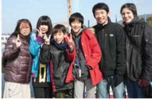
ABOVE: Reaching the next generation of Japanese