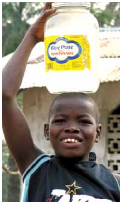
BELOW: Providing clean water