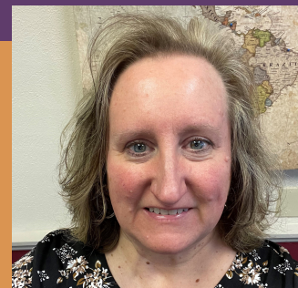
FROM THE DESK...

Greetings in the Name our Lord and Savior, Jesus Christ!