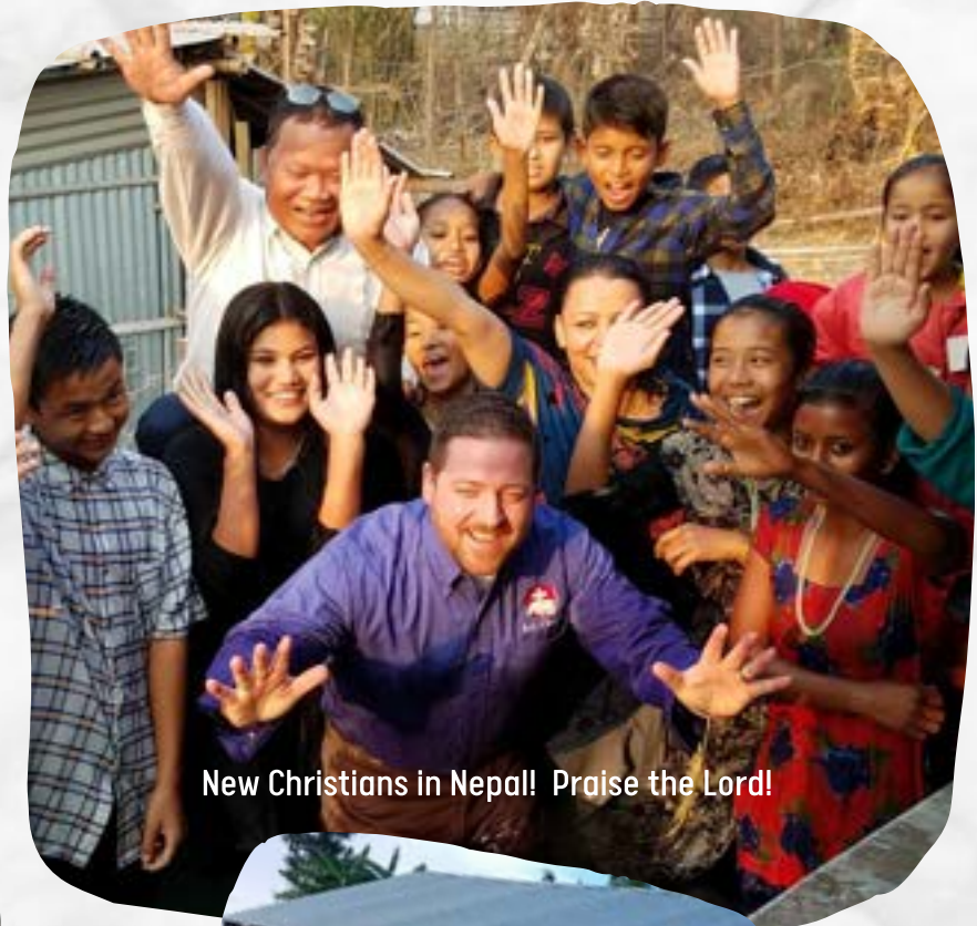
New Christians in Nepal! Praise the Lord!