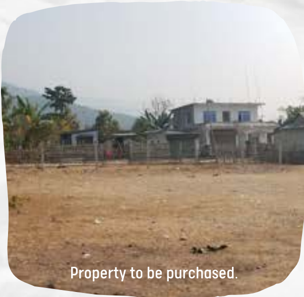
Property to be purchased.

This year's missions emphasis is on Nepal, and the purchase of the parcel of land, directly next to the ECCN (Evangelical Congregational Church Nepal) Headquarters. A leadership training center will be built on this land to assist the ECCN in training up the next leaders in God's Kingdom and the EC Church in Nepal. Resources to use for your Missions Moments during VBS are available on the GMC website: gmc.eccenter.com ; click on "resources."