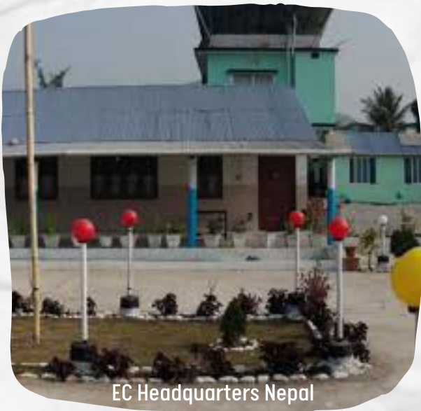
EC Headquarters Nepal