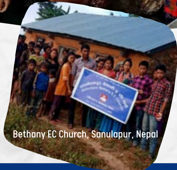
Bethany EC Church, Sanulapur, Nepal