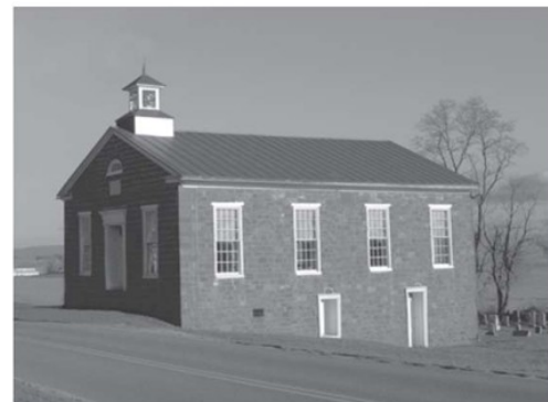
Albright Memorial Chapel