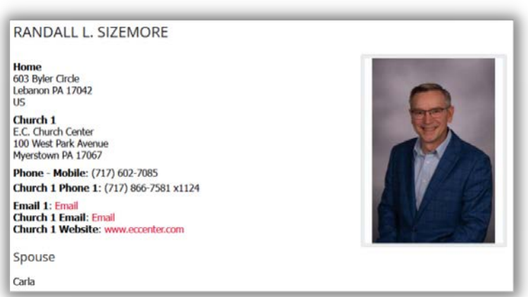
Detailed Contact Card