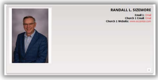
Front page listing

• Online Directory with pictures, if available: This directory contains information for all those currently credentialed in the denomination along with those of superannuated, supernumerary and retired status. The front page listing contains basic information, but by clicking on any one individual's name, you can see more detailed information such as is found in Section 1 of the journal. Double check the links to your church websites and social media pages along with your personal and associated church information. If there is not a picture included in your directory listing, kindly send a close-up photo of yourself that clearly shows your face to office@eccenter.com.