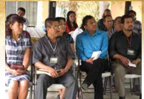
TOP: Mexico's Pastors and lay leaders enjoy training during Annual Conference