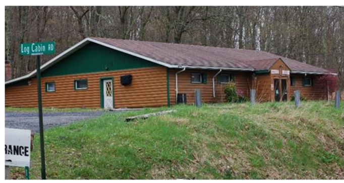
Our new home! Located on Bushkill Falls Road across the street from the post office, and in full view of thousands of residents who travel this road daily to the schools at the North Campus of East Stroudsburg School District.

We are extremely grateful for the generous contributions from our EC family of churches toward our renovation project. Converting an old restaurant/bar into a church has become a bigger endeavor than we originally anticipated. None the less, we are confident that the Lord will continue to provide the means that will open the doors for us to begin ministry in this place. As of September 19, we