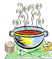
Mission Leaders' Luncheon