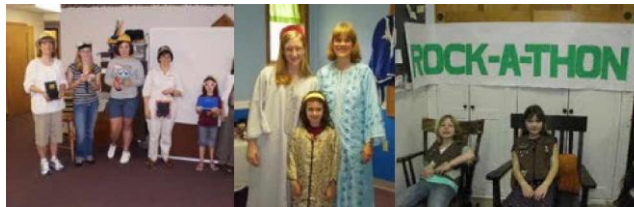
Below Left and Center: MMK Ohio/Western PA Below Right: Kutztown Rock-a-Thon for Missions